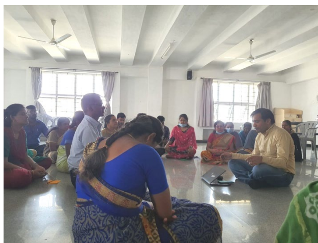
Participants involved in meditation