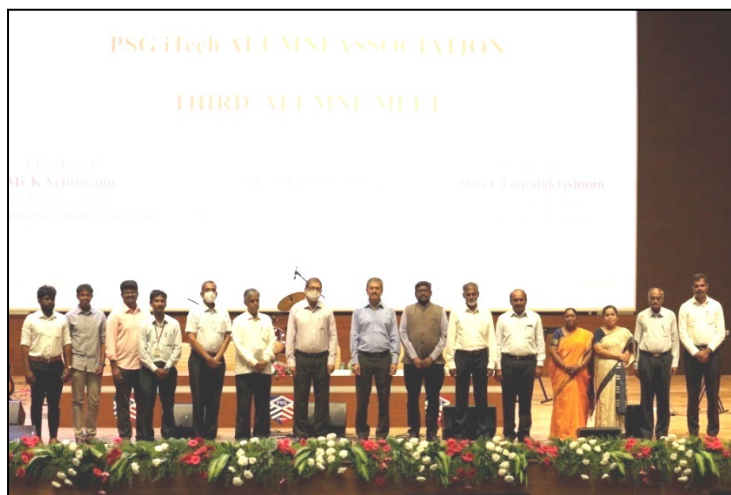
Third Alumni meet held on 12 th Feb 2022