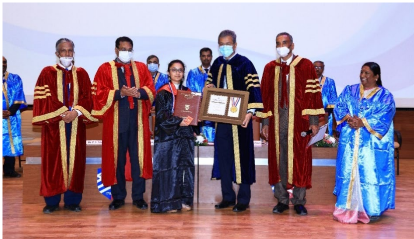
Third Graduation Day ceremony held on 12 th Feb 2022

Further, he urged the young graduates to dream big and have the self-belief to achieve excellence in their desired field. Especially, he requested the graduates not only to be a part of the generation of new knowledge but work for protecting the Intellectual properties. Finally, he advised all the engineers to work till their last breath for the country with high hopes. Later, alumni interaction was organized to create space for interaction between the first-year students and the graduates. As part of the graduation day, alumni meeting was also organized in the evening with musical performance by the music club.