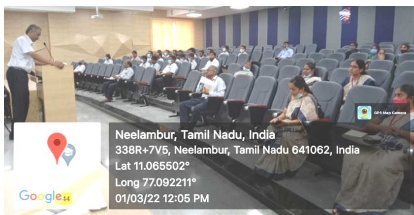
Online Webinar on Academic Identity and Faculty Profile: An Overview held on 1 st Mar 22