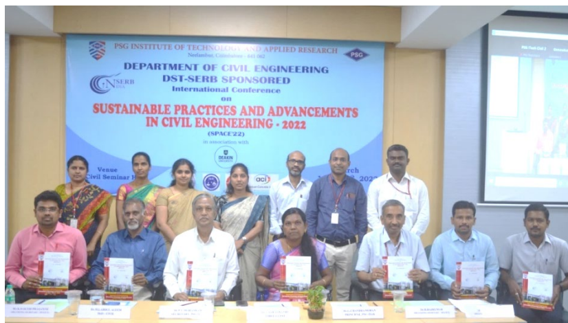
Release of SPACE'22 Conference Proceedings