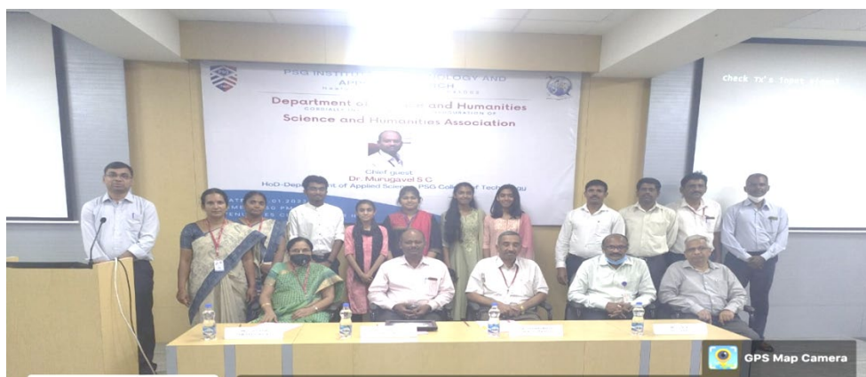
Inaugural function of the Science and Humanities Association was held on 03.01.2022