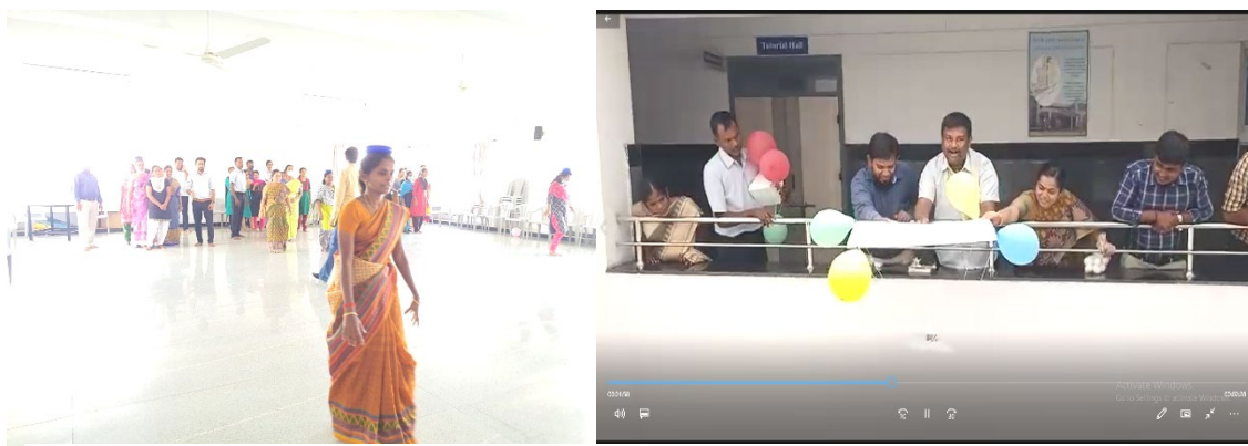
Participants involved in games and objects-based activities