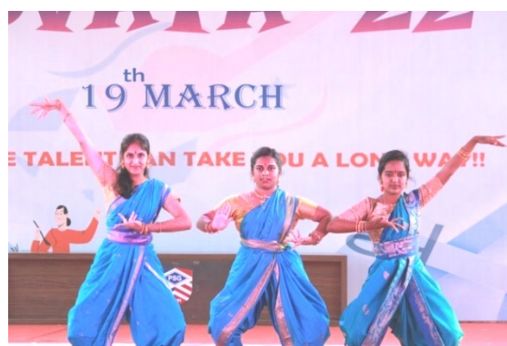
Students performance during Cultural Fest - Advaya 2022