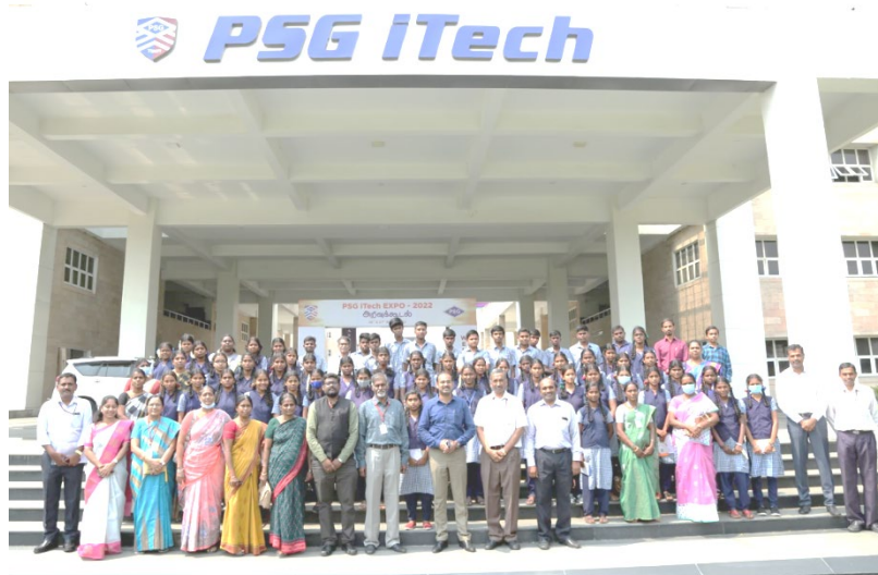
Group photo taken during iTech Expo 2022