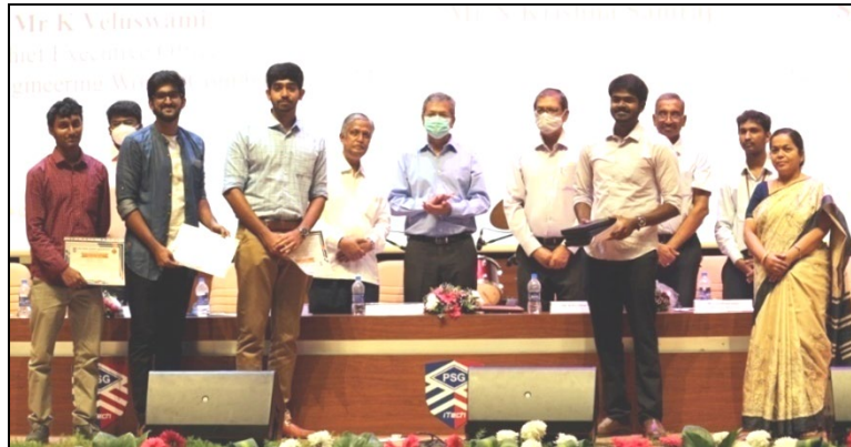
Best Final year project awards have been handed over by the Chief Guest and Managing Trustee to the top two project teams in each branch of 2016-20 Batch.

The 2016-20 Batch students and project supervisors have received the best project award certificates and prize from the dignitaries. PSG iTech alumni (2014-18 and 2015-19 batches) handed over the scholarship money of Rs. 85,000/- (Rupees Eighty five thousand only) to the Principal.