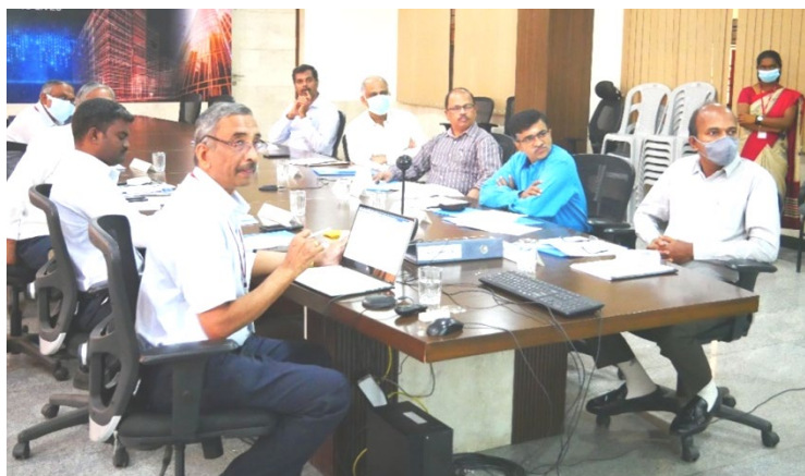
Members at board room of PSGiTech during Eighth Governing Council Meeting was held on 04 th March 2022