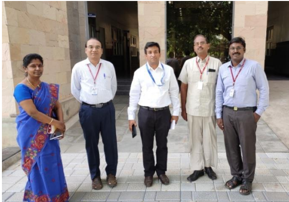
Department Advisory Committee (DAC) meeting for the B.E Computer Science and Engineering Programme was held on 17.06.2019