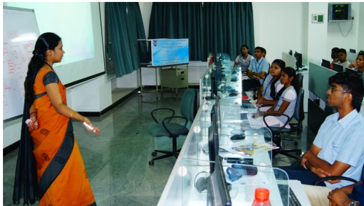
VAC on “Cyber Security and Forensics” held on 24 th June 2019