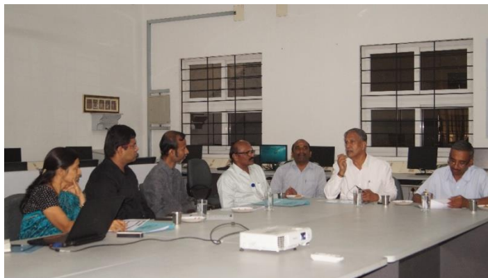
Department Advisory Committee members during their discussion on 20 th June, 2019