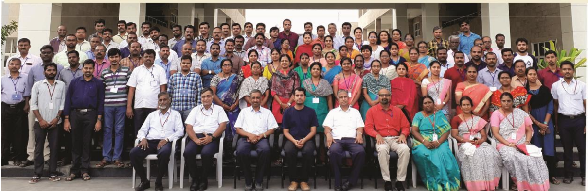
Group photo of AICTE sponsored 7-day Level – 1 “Student Induction Programme” held during 17 th to 23 rd June, 2019