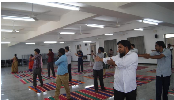
Participants doing Katishakti Vikasak (Trunk Twisting)