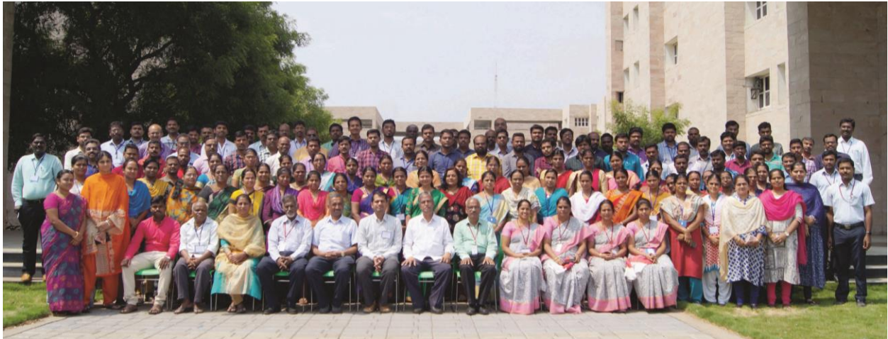
A photo taken during the AICTE sponsored 3-day “Student Induction Programme-Level 0” held from 27 th to 29 th May 2019