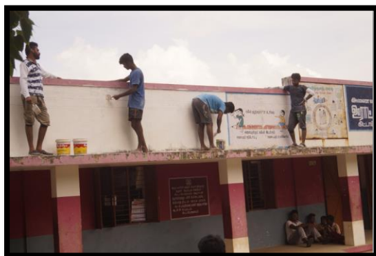
Active participation by the NSS volunteers of PSGiTech at the Government School, Kittampalayam on 5 th Dec 2018