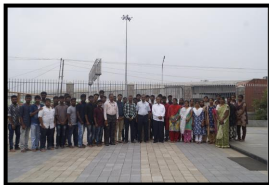
PSG iTech students numbering 50, visiting Kittampalayam Village, as a part of NSS camp starting from 4 th December 2018