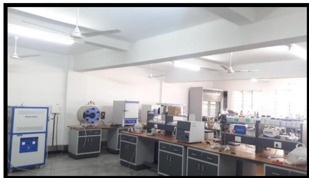
An Overview of Polymer Engineering Laboratory at PSGiTech