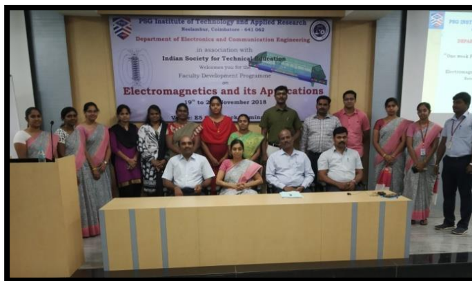
Participants of FDP on “Electromagnetics and its Applications” 19 th to 24 th November, 2018

The Electronics and Communication Engineering Department organized a one week FDP on “Electromagnetics and its Applications” from 19 th to 24 th November 2018. 12 Faculty from different engineering colleges participated in the FDP. The FDP covered the fundamentals of electromagnetics with emphasis on its physical understanding and its applications. The sessions were handled by 4 subject experts from other institutions and 5 internal faculty members.