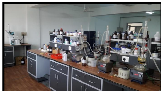
Progress of Synthesis work in the laboratory at PSGiTech