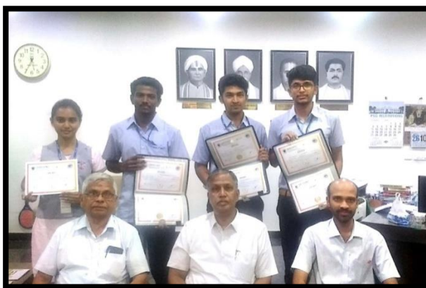
PSG iTech Students who won the 1 st & 2 nd places in National Level Contest on Engineering Graphics on 24 th November 2018