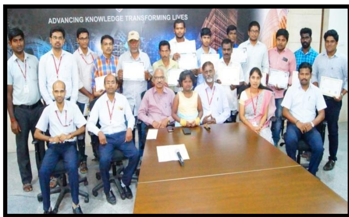
Participants along with Civil Engineering Faculty members on 15 th December 2018