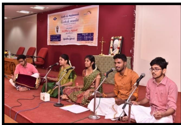
Music Performance of PSG iTech students on 22 nd December 2018 during PSG Vaanavil Programme