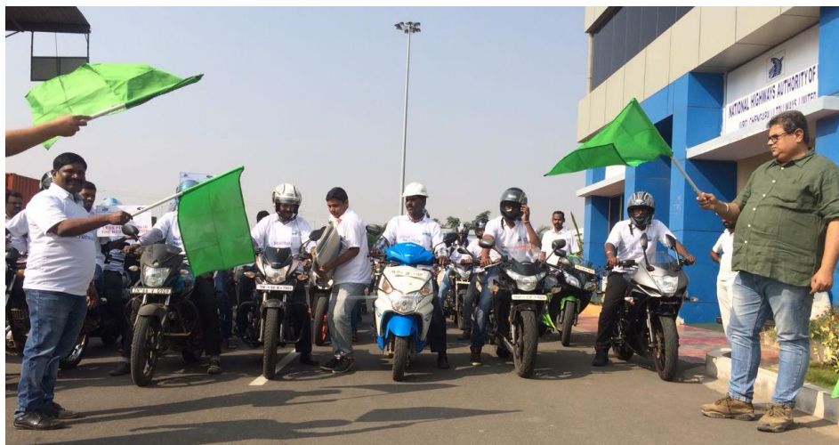
PSG iTech NSS volunteers took part in the Bike Rally from 16.01.2018 to 31.01.2018

As per the direction from Ministry of Road Transport & Highways (MoRT&H), Government of India, National Highways Authority of India (NHAI) observed “SwachhtaPakhwada” from 16 th to 31 st Jan 2018 throughout the country under Hon’ble Prime Minister’s prestigious programme “Swachh Bharat Mission”. In connection with the above programme, NHAI, Coimbatore has conducted a bike rally to make an awareness about cleanliness. PSG iTech NSS volunteers took part in the rally along with other volunteers from NHAI department. The rally began at 9.30 am from “Kaniyur Toll Plaza on NH-544 to Chengapalli and back to Kaniyur Toll Plaza which covered around 100 km from the college.