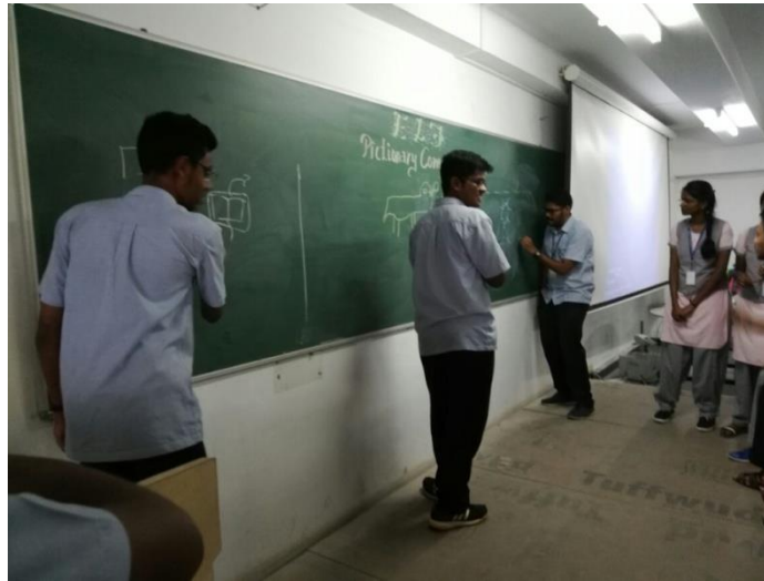
Pictionary Competition held on 14 th Feb 2018