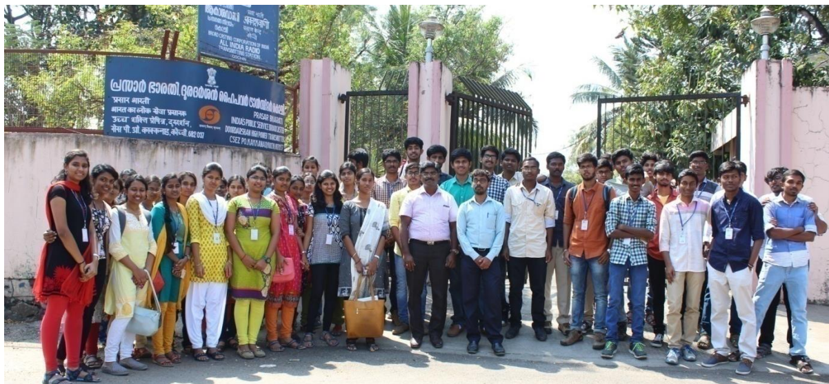
Industrial visit to Doordarshan on 2 nd February, 2018 and to M/s Traco Cable Company Limited on 3 rd February 2018 by the students of EEE department of PSG iTech

A team of 46 students from EEE department of PSG iTech accompanied by three faculty members went on an industrial visit to Doordarshan on 2 nd February and to M/s Traco Cable Company Limited on 3 rd February 2018.