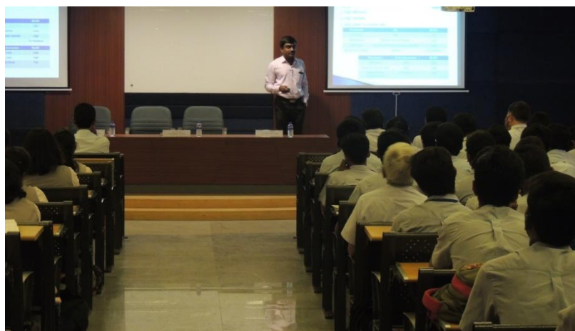
Guest lecture on the topic "BLDC Fans and Drives" for the first, second and third year -B.E EEE students on 27 th February 2018