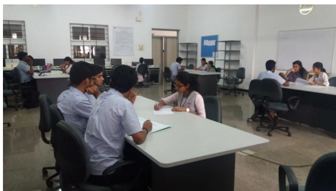
Panel of ECE final year student interviewers with the candidates

As a part of Placement Activity, a mock interview was conducted with the help of 15 placed final year ECE students as the interviewers, from 2 nd February 2018 to 8 th February 2018. The students were evaluated for 50 marks based on technical skills, resume presentation, HR questions, communication skills and body language. The comments after the interview were shared with the students individually by the interviewers. The questions posted by the interviewers were similar to the ones asked in the actual interview during placement drive.