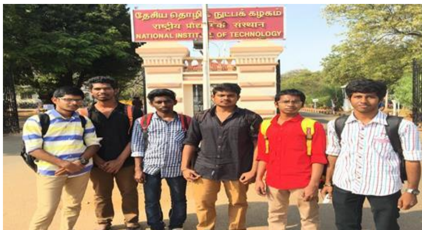
Students attended the workshop on swarm robotics in National Institute of Technology, Trichy on 17 th and 18 th February 2018.