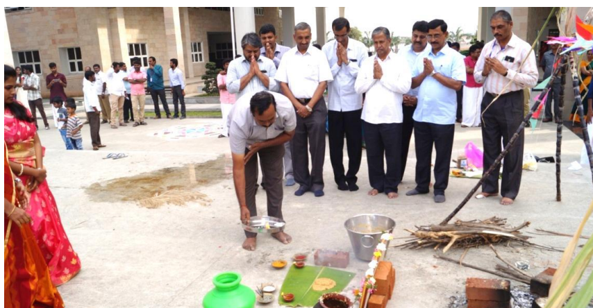
Pongal celebrations held on 20 th Jan 2018 in the college premises at PSG iTech