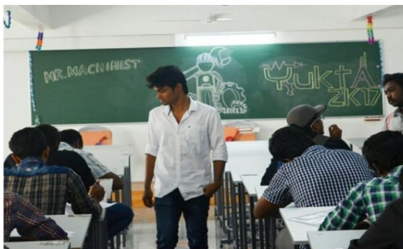
Fig 7: “Mr Machinist” Event was conducted on Yukta: 2017 held on 17 th February 2017