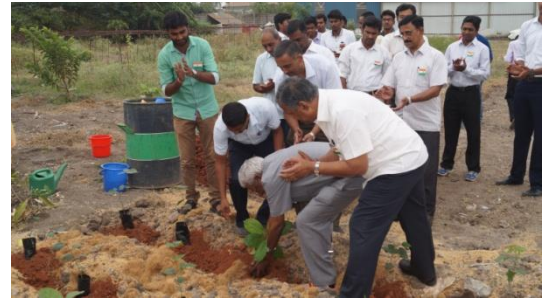
Fig 4: ECO-Club Members of iTech during Tree Plantation with Chief Guest, Prof V Ramachandran on Republic day function held on 26 th January 2017