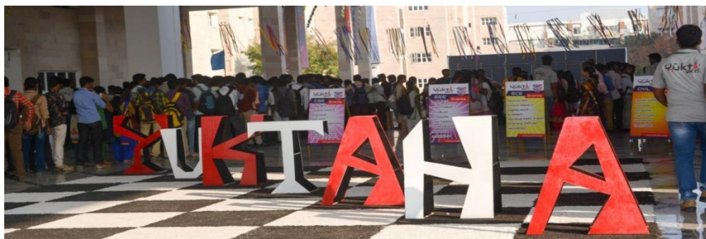
Fig 6: Registrations for the National Level Intercollegiate Technical Symposium, Yukta: 2017 held on 17 th February 2017