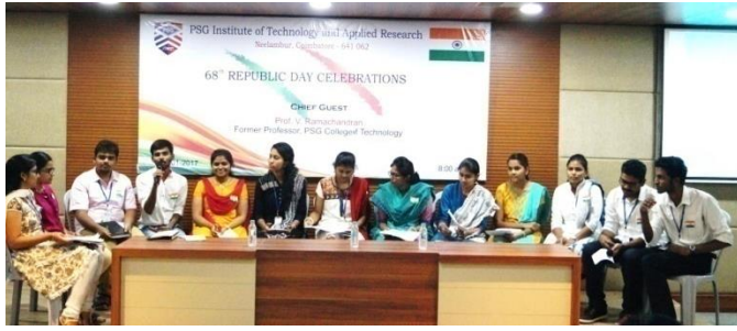
Fig 3: iTech Students participating in a cultural event iVision-2017 on Republic day function held on 26 th January 2017