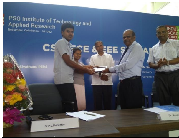
Fig 15: PSG iTech students presenting the memento to the chief guest Dr A Sivathanupillai, MD, BrahMos Aero Space on the occasion of inauguration of Industry Academia Conclave – 2017 held on 10 th March 2017.