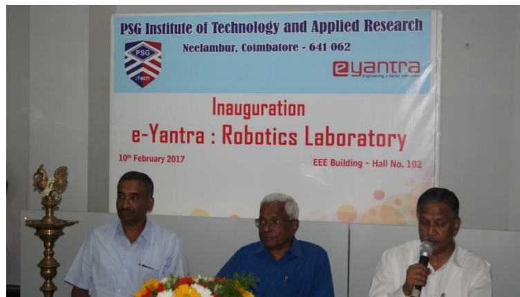
Fig 5: Inauguration of e-Yantra: Robotic Laboratory on 10 th February 2017