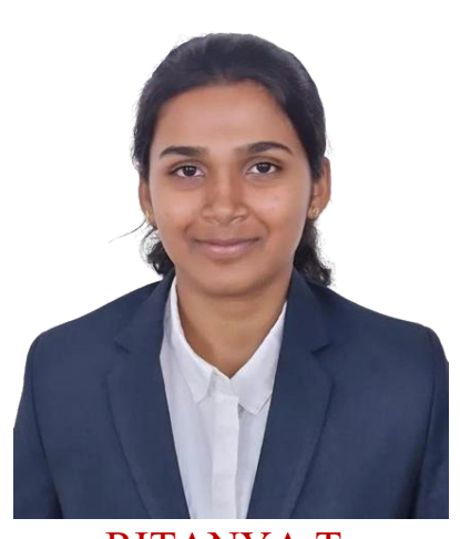
RITANYA T III CSE KAVERI