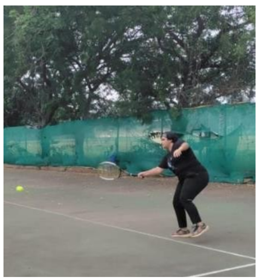
Anna University Lawn tennis interzonal match

She also led the Ball Badminton , Badminton and Table Tennis college teams . The ball badminton team placed 4<sup>th</sup> in the anna university zonal match.