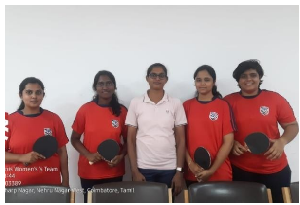
TABLE TENNIS TEAM