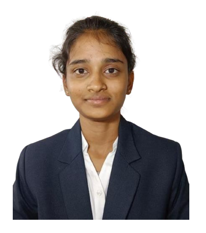
ABINAYA K II ECE GODAVARI