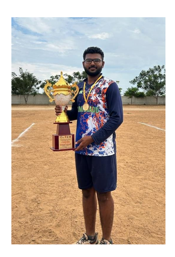
7<sup>th</sup> Senior National Fistball Tournament

He is also part of our college Handball team since 2021 and participated in Anna University Zone and CENTIES tournaments.