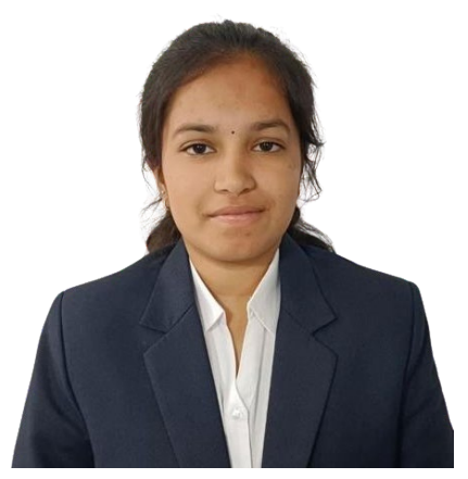
SAGHANAA T II EEE ALAKNANDA