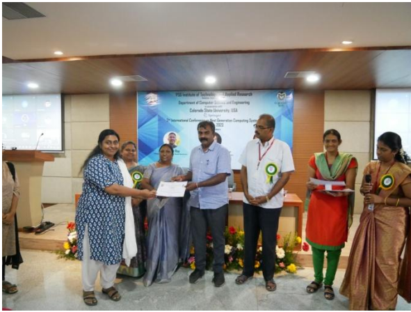
Valedictory Function Best Paper Award