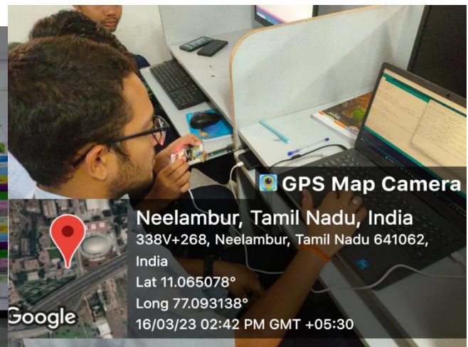
Preconference Workshop session