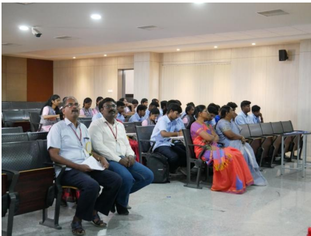
Conference Keynote Address