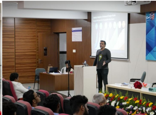
Conference Keynote Address