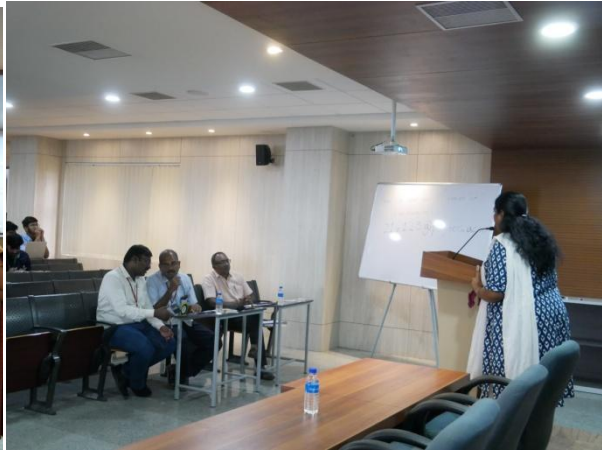
Conference Technical Session