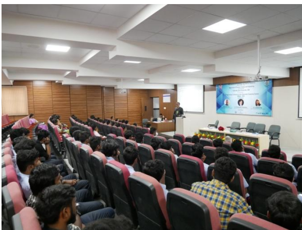
Conference Keynote Address