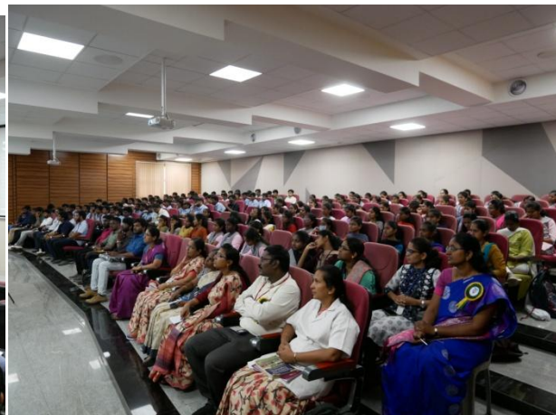
Conference Keynote Address