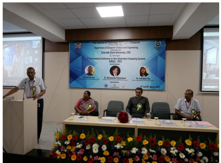
Inaugural Presidential Address By Dr.G.Chandramohan