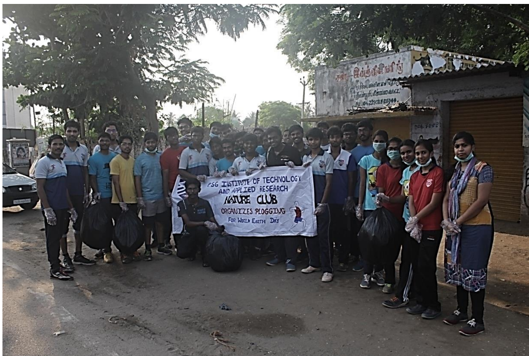
The students and staff participants of plogging activity.