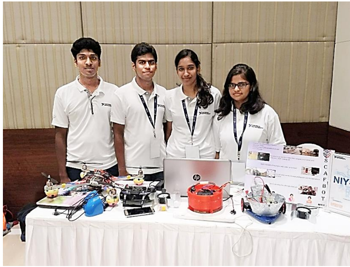
The team with the SCAF robot at NI Yantra Contest