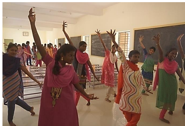
PSGiTech NSS Team visited the Deaf & Dumb school at Thekkalur on 24 th September 2017

PSG iTech NSS team had visited the DEAF AND DUMB SCHOOL at Thekkalur, on 24 th September 2017, which was officially declared as NATIONAL SERVICE SCHEME DAY. The NSS volunteers had started early at the morning around 9.00 am to reach the orphanage. The differently-abled people from that school greeted the NSS volunteers with warmness. At first the instructor had introduced PSGiTech students to the people in sign language. SIGN LANGUAGE helps these deaf and dumb people to communicate with each other. The NSS team had already planned to conduct fun events at the orphanage so that the people will feel at home. So, the boys were trained to play sport events like volleyball, throw ball along with the NSS volunteers.