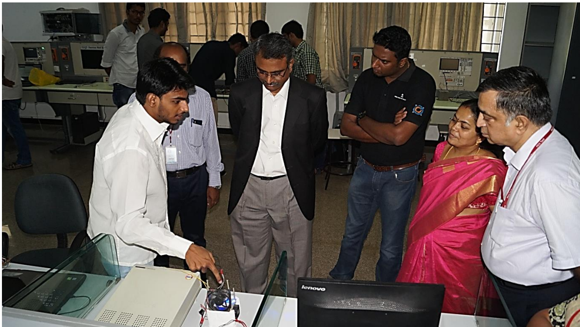
Students of ECE department demonstrating their projects on 17.03.2018