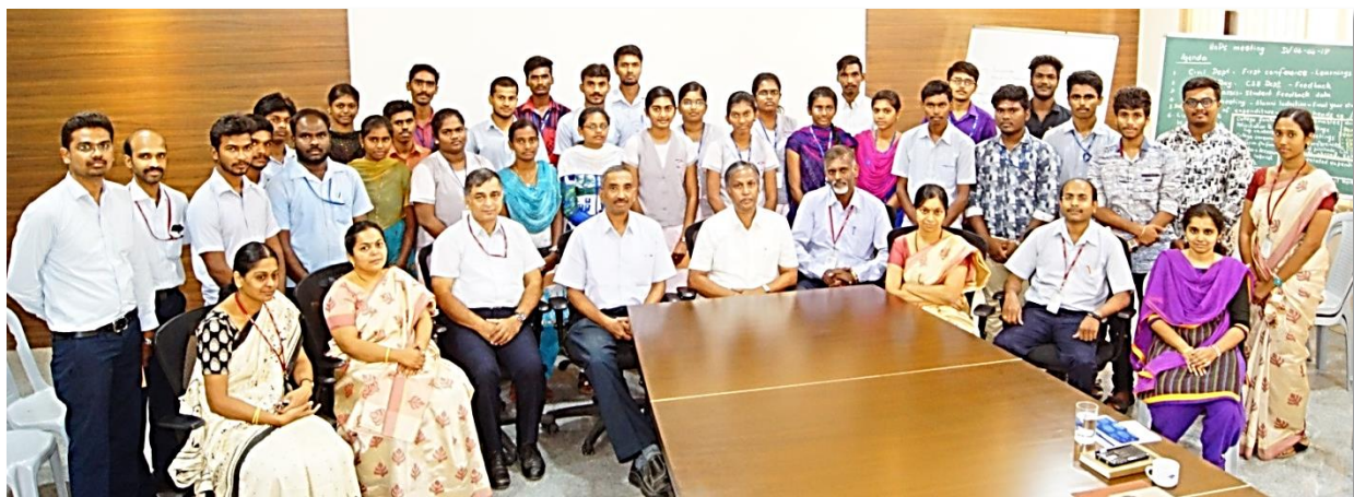
Distribution of Merit-cum-Need scholarships to PSG iTech students during the academic year 2017-18 on 11 th April 2018, along with some of the donors; in all, 40 students were awarded the scholarships