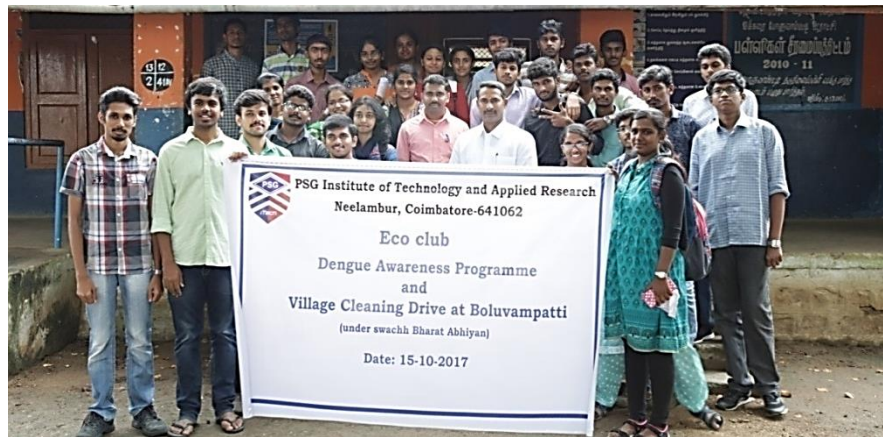
Dengue awareness programmeme was conducted by PSG iTech students at Boluvampatti, Coimbatore on 15.10.2017

The ECO Club of PSGiTech organized dengue awareness campaign in Boluvampatty on 15 th October 2017. Dengue cannot be prevented by giving vaccine, but its spread can be controlled through awareness campaign among the public. A door-to-door dengue awareness campaign was conducted. The students gave out hand-outs and briefed them about the disease, its effects, symptoms, remedies and control measures. The people appreciated the students for their committed work and assured them that they would follow the preventive measures suggested by the students.