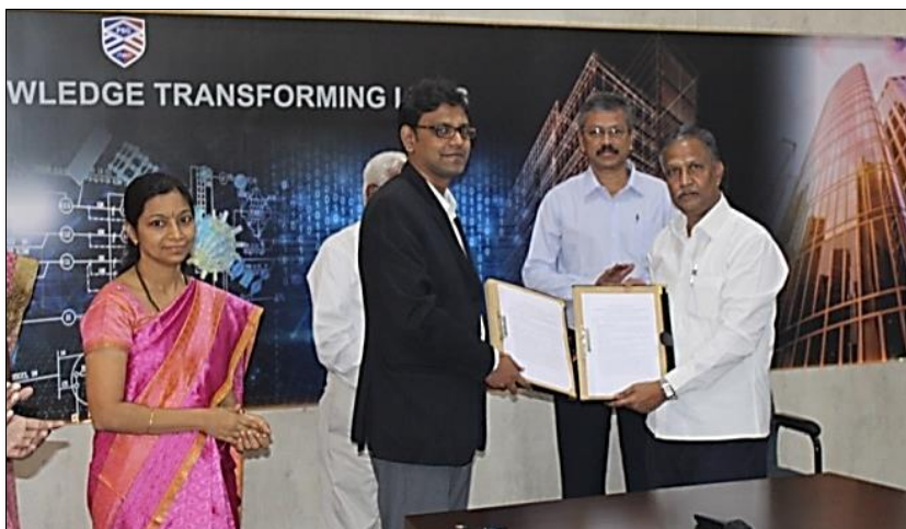
A Memorandum of Understanding (MoU) was signed between the college and Nexmoo Solutions (India) Pvt. Ltd. on 17 th August 2017