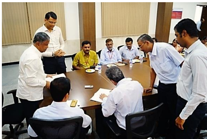
MoU signed between PSGiTech and Magnus Prep on 25 th September 2017

A Memorandum of Understanding was signed between Barry – Wehmiller International (B-WI), Chennai and PSG Institute of Technology and Applied Research, Coimbatore on 20 September 2017. The objective of this MOU is to develop and execute education programs and academic projects through Career Oriented Engineering (CORE) program. CORE program is an initiative by B-WI to bring industry expertise to the engineering students in the campuses. This program works on the principle that imparting employability skills to engineering students. A minimum of 30 students may enrol every year for Mechanical and Electrical for the first year discipline and will add students in successive years based on the willingness of the students at the end of the first year training.