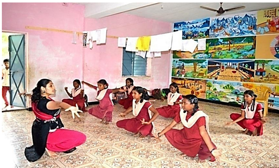
Student of PSGiTech teaching Bharathanatyam to school students at NSS camp Kumarapalayam